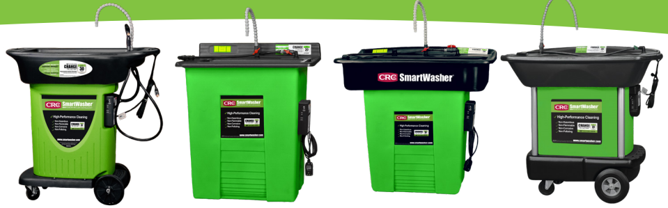
SW-23 Mobile Parts/Brake Washer